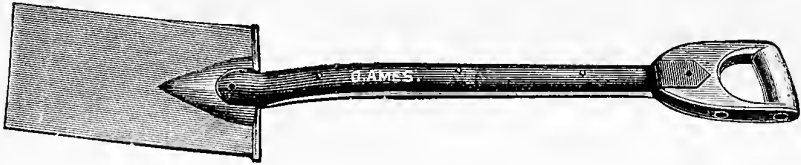
D Handle, Double Strap, Reinforced Nursery Spade. Weight. 9½ lbs.

We have experimented with a number of different makes of nursery spades, but find this to be the strongest, best and most durable on the market. We have been using this spade for a number of years and it will stand more hard work than any other make. It is strapped full length of handle both back and front, and half way up it has double straps, strengthening it in what would otherwise be its weakest parts.